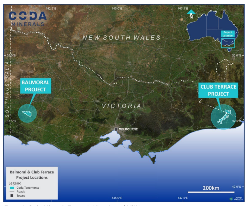
Figure 1: Coda Minerals Tenure in Victoria and NSW

Coda Minerals Ltd (ASX: COD; "Coda") is pleased to advise that it has been notified of the grant of exploration tenure in Victoria considered to be prospective primarily for gold and rare earths. The tenure was inherited through the Company's successful acquisition of Torrens Mining earlier this year to consolidate ownership of the Elizabeth Creek Copper Project in South Australia.