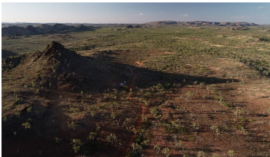
Figure 1 Looking north from the Copper Weed prospect