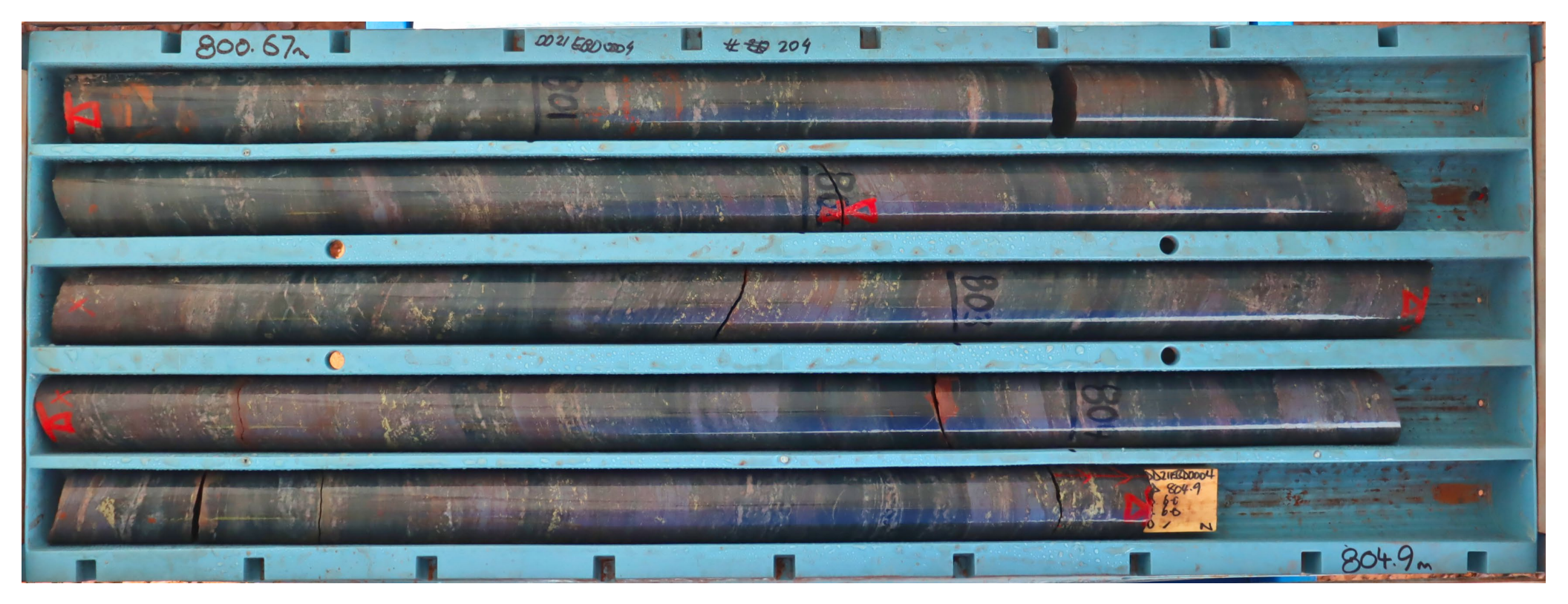
Figure 1 Mineralisation encountered in haematised Wallaroo Group sediments, drillhole DD21EBD0004. Dominated by chalcopyrite, the mineralisation consists principally of bedding aligned blebs and veinlets plus minor disseminations.

6 Altona Street West Perth Western Australia, 6005